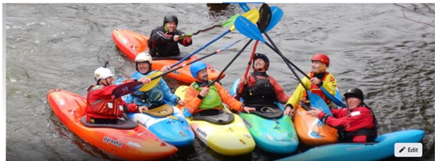
DEVA KAYAKERS + friends of.